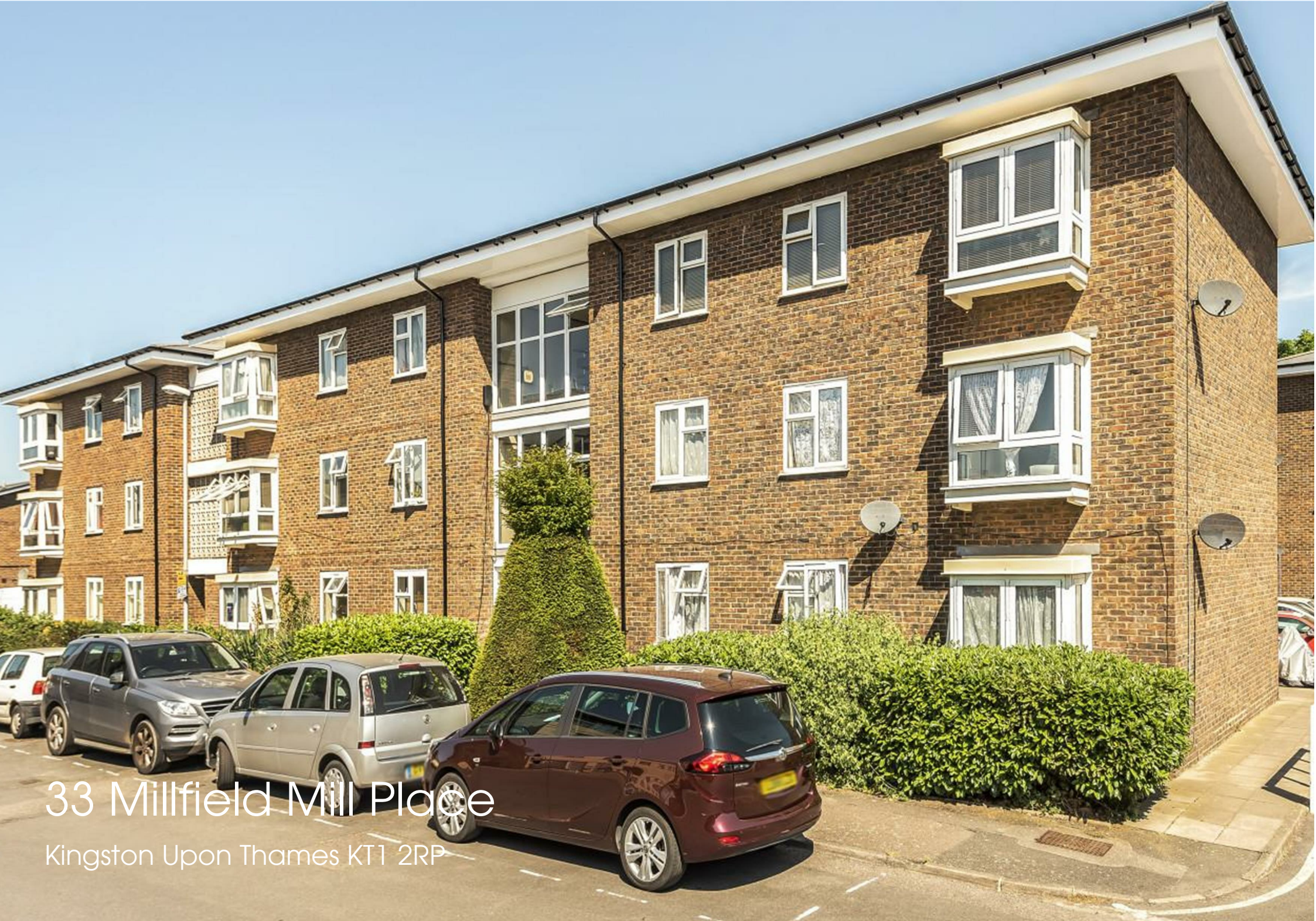
33 Millfield Mill Place Kingston Upon Thames KT1 2RP